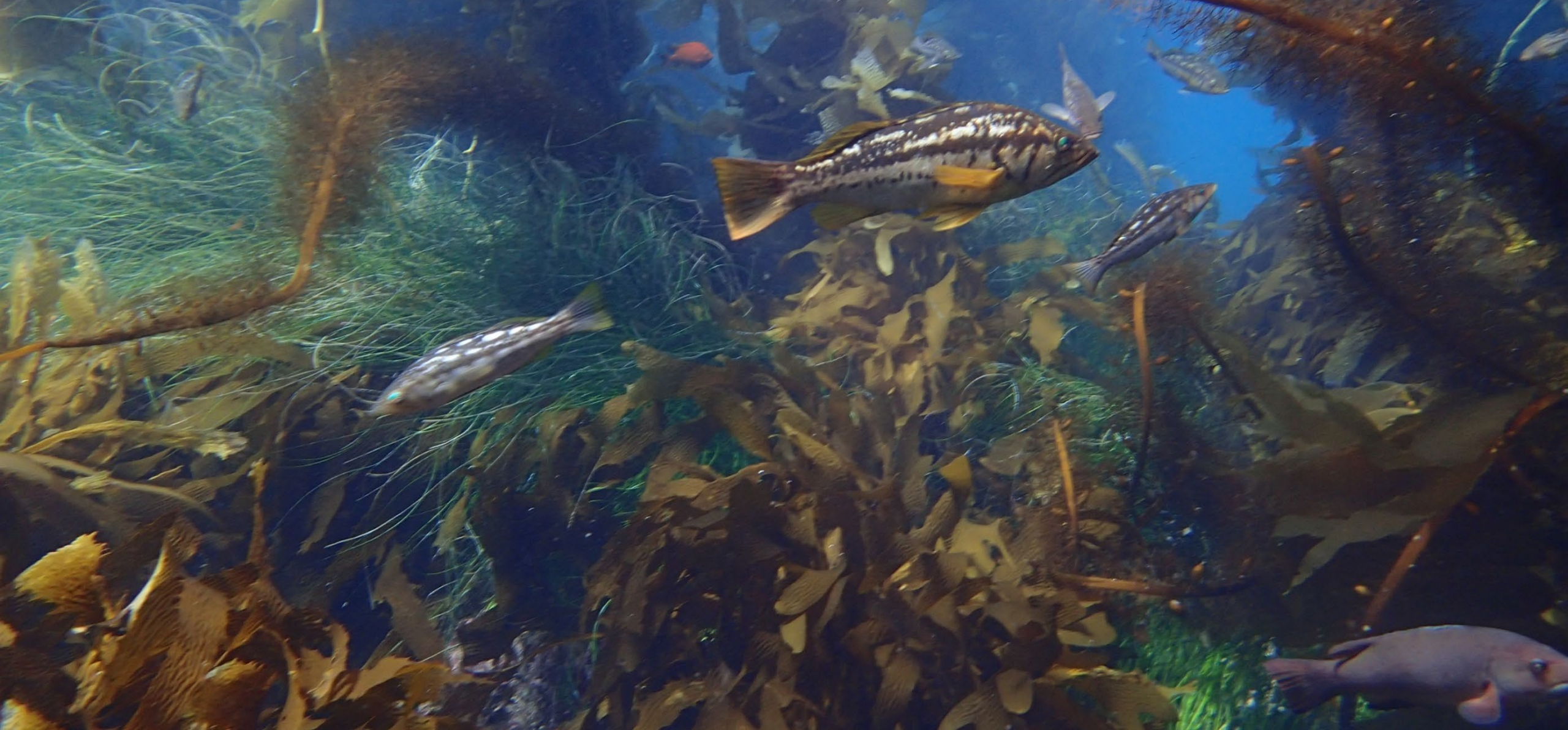
Palos Verdes Kelp Restoration